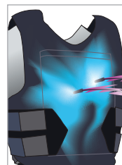
ThorShield™ absorbs electrical charges and prevents incapacitation

Law enforcement experts report an increase in the rate that officers are being shot with their own weapons, especially less-lethal energy arms. These authorities are recommending the use of apparel/devices that are resistant to weapons used in such attacks. ThorShield™ is a durable, lightweight, conductive material that effectively protects the wearer when hit in the vest with less-lethal energy weapons, such as TASER® devices and other electro-muscular disruption weapons.